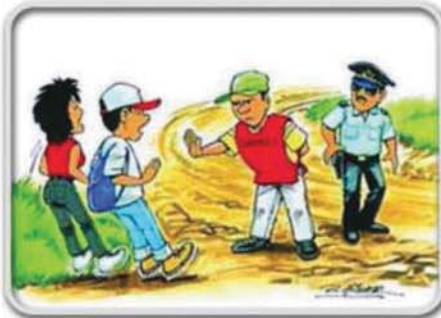
Do not approach dangerous places.