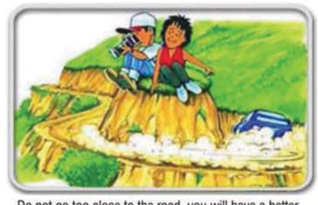
Do not go too close to the road, you will have a better view and you will be safer on a higher position.