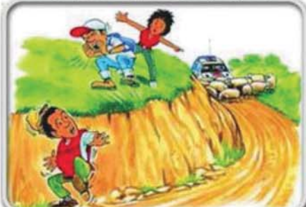
If you notice something that requires immediate intervention, please inform the nearest marshal.