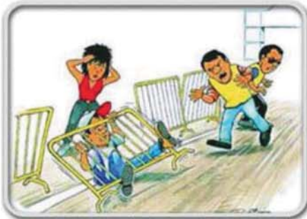
Do not obstruct the organizers in their work. If you can, help them.