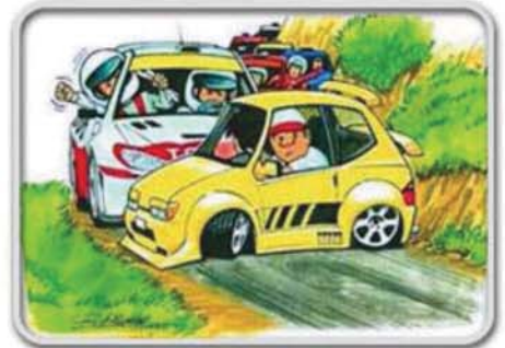
Be careful while driving on the rally itinerary.