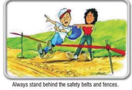
Always stand behind the safety belts and fences.