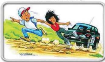
Arrive on time for the previously selected location.