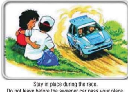
Stay in place during the race. Do not leave before the sweeper car pass your place.